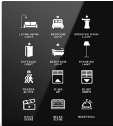
Programmable Buttons (up to 12 push buttons)